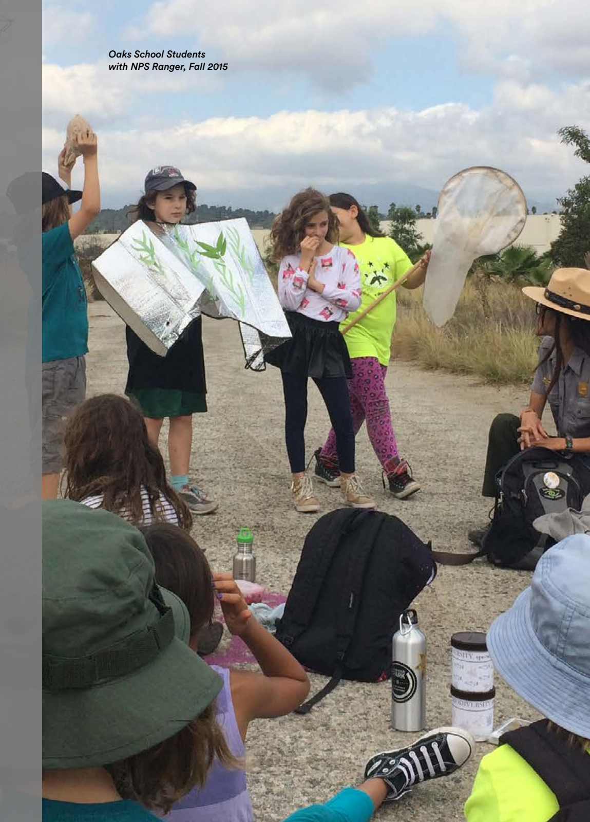
Oaks School Students with NPS Ranger, Fall 2015

Plant & wildlife information courtesy of our friends at the National Park Service.