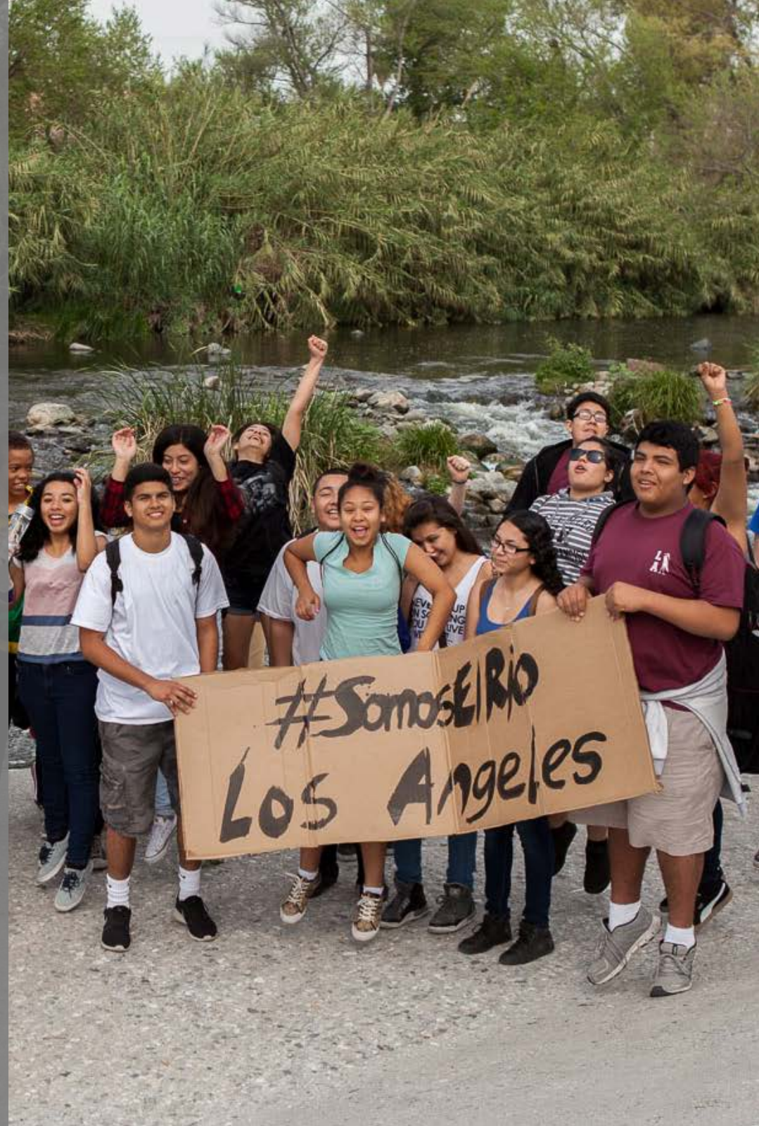
Right: Sotomayor Learning Academies 9th Grade Students, Spring 2015

The Bowtie Project sits along the Glendale Narrows, a soft-bottom portion of the approximately 51 mile long Los Angeles River. A walk down the channelized banks puts visitors right at the edge of one of the most lush and vibrant natural ecosystems along the river today. This section of the once neglected waterway is slated to receive up to $1 billion dollars towards restoration of the riparian habitat.